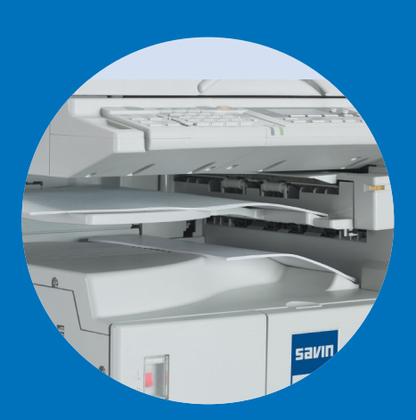
Easily identify inbound faxes and keep them separated from print and copy output with the One-Bin Tray (available on the 8020/8020d).